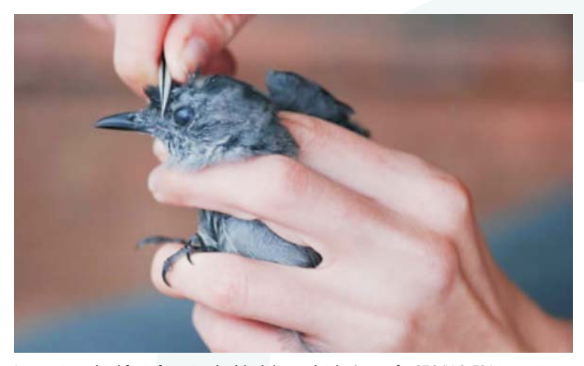
Inspecting a bird for infestation by black-legged ticks (part of a GEO/U.S. EPA investigation of biodiversity, habitat change, and the risk of Lyme disease).

The results will help environmental decisionmakers and public health practitioners better understand the effectiveness of such measures as repellents, integrated pest management, land use practices, and disease treatment.