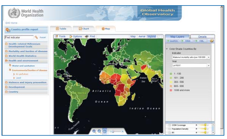
WHO's Global Health Observatory.

outputs for specific diseases. A "Health and Environment" module provides access to data from WHO and other organizations on diseases with environmental risk factors. The goal of this effort is to support the development, assessment, and validation of decision-support tools, working toward standardized assessment tools for the health community.